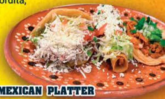
RC MEXICAN PLATTER