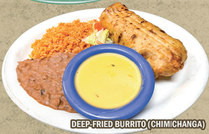
DEEP-FRIED BURRITO (CHIMICHANGA)