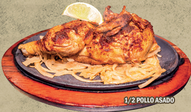
1/2 POLLO ASADO

Chicken garlic, chile de árbol sauce, rice, beans, and tortillas. Guerrero style. 15.50