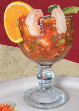
Shrimp Cocktail 19.50