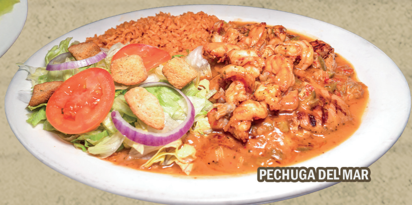
PECHUGA DEL MAR

Rice, salad, grilled onions, bell peppers, mushrooms, and tortillas. 23.99