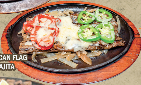
MEXICAN FLAG FAJITA