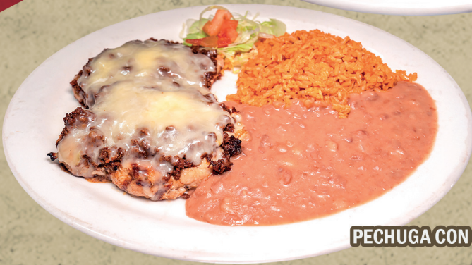
PECHUGA CON CHORIZO