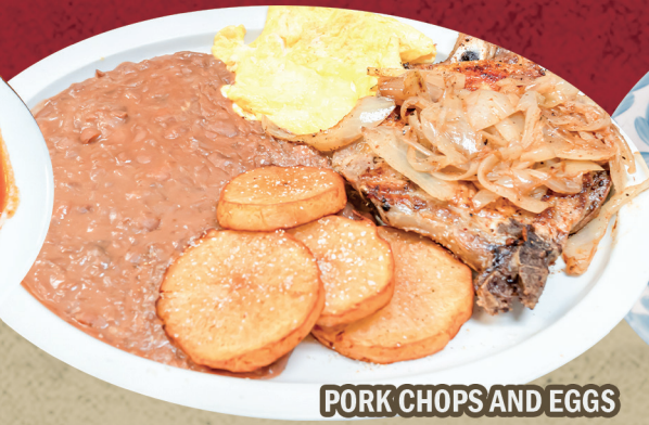
PORK CHOPS AND EGGS