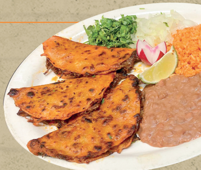
CHEESY BIRRIA TACOS

Juiciest birria, crunchy corn tacos. 17.50