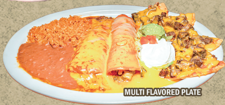
MULTI FLAVORED PLATE