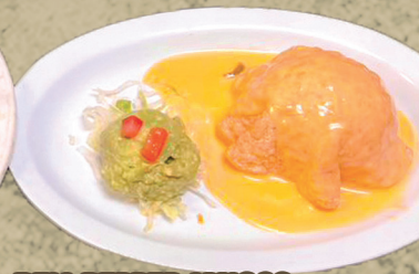
BELL PEPPER AMIGOS