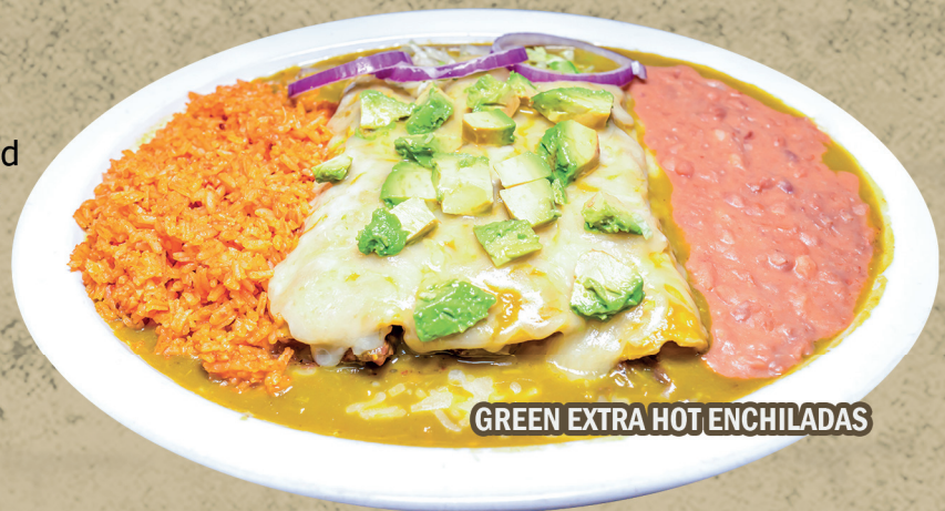
GREEN EXTRA HOT ENCHILADAS