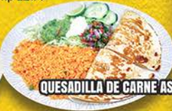
QUESADILLA DE CARNE ASADA