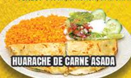
HUARACHE DE CARNE ASADA

Pollo / Chicken 10.50 Carnitas / Pork 11.00 Queso / Cheese 9.00