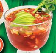
COCTEL DE CAMARÓN