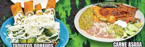
TAQITOS DORADOS AHOGADOS